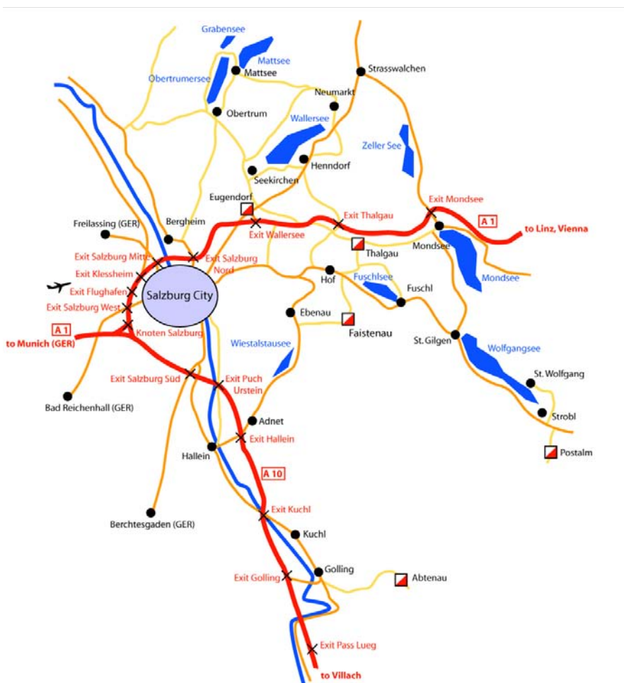
Illustration 2: Local overview with CC and competition sites